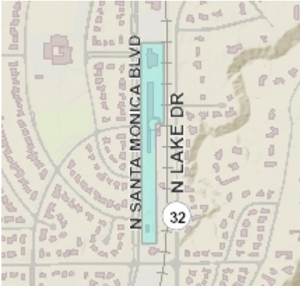
Parcel location within Milwaukee County