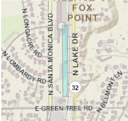
Parcel location within Milwaukee County