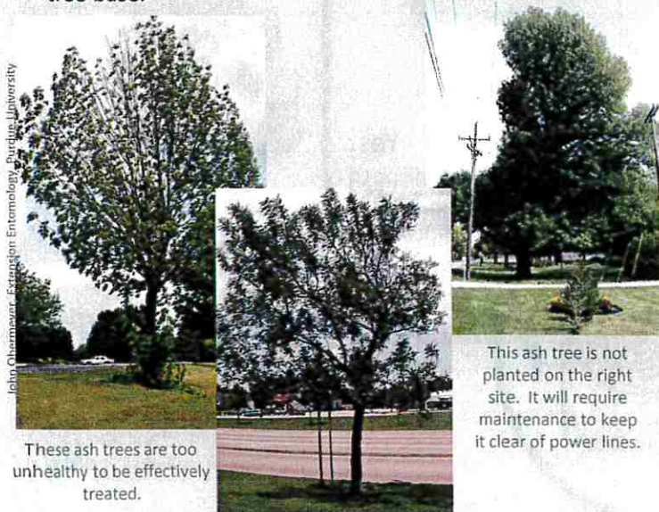
These ash trees are too unhealthy to be effectively treated.